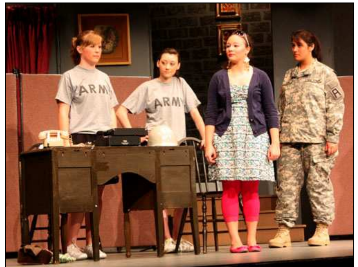
Christ Our Rock students performed two pieces for the spring drama. A short comedy, Amy Goes Army (ABOVE and TOP RIGHT) preceded the main feature, Agatha Christie's Mousetrap (BOTTOM RIGHT).