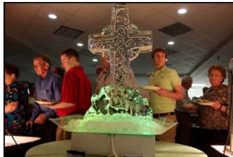
CORLHS students, PHOTO AT LEFT, bring out gifts to high bidders; patrons line up during the buffet dinner, RIGHT, and pass in front of the beautiful ice sculpture cross.